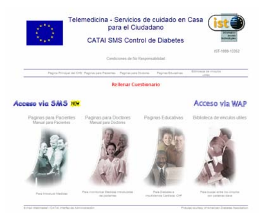
Fig. 2. DP Assistant. Login page in the application server

Healthcare professionals logged in the system using a web interface (Fig. 2) to consult patient records and to send a SMS with concerning patient information when required (Fig. 3).