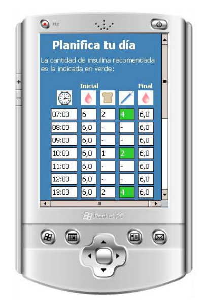
Fig. 6. Application in phase of insulin daily dosage calculation.

Glucose value and insulin estimations were sent automatically to the healthcare monitoring center where healthcare professionals access patient's information for further control and advise. If it was required the patient received an SMS message through the application server web site.