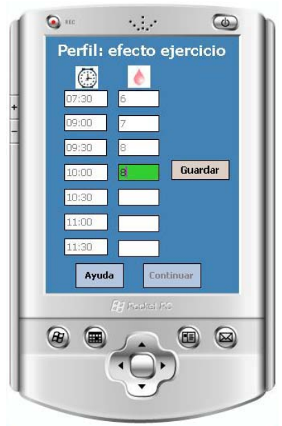
Fig 5. Application (client) in training stage.

Icons from Pilarski's method ® keep the interface friendly (Figure 5).